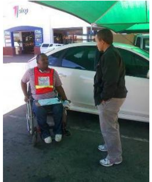
A motorist in Klawer receives a license disc after making his pledge.

Join us for the next Campaign on 25 June and 16 July, and lets keep South Africa's roads safe!